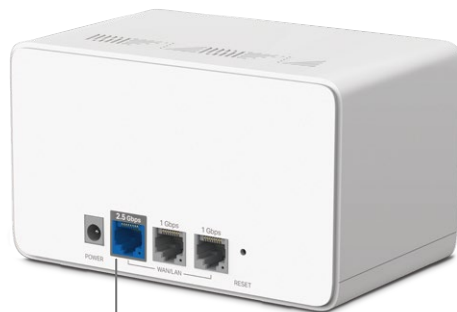
2.5 Gbps Port